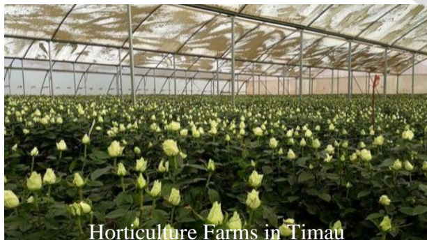
Horticulture Farms in Timau