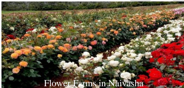
Flower Farms in Naivasha