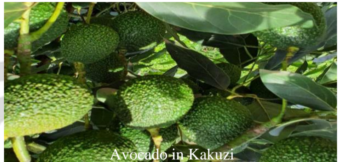
Avocado in Kakuzi