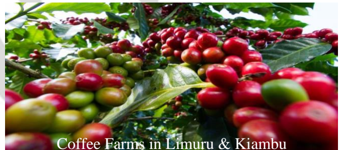
Coffee Farms in Limuru & Kiambu