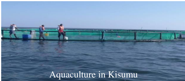
Aquaculture in Kisumu