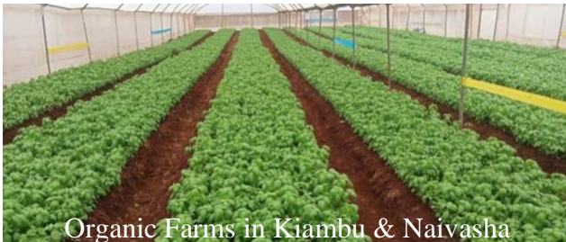
Organic Farms in Kiambu & Naivasha