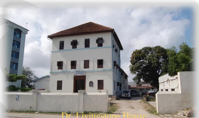
Dr. Livingstone House