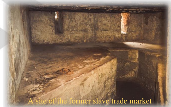
A site of the former slave trade market

Inclusive Holidays Limited Waiyaki Way, Westlands The Mall, 2 nd Floor P.O. Box 55504 – 00200 Nairobi, Kenya