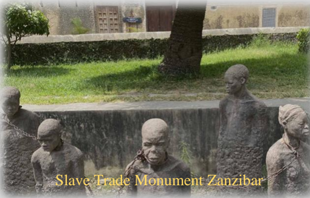
Slave Trade Monument Zanzibar