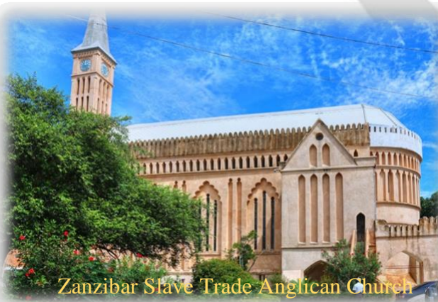
Zanzibar Slave Trade Anglican Church