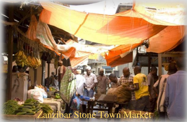
Zanzibar Stone Town Market