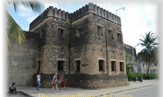
Discovering History & Culture