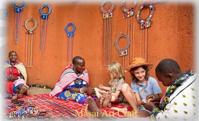
Masai Art Craft